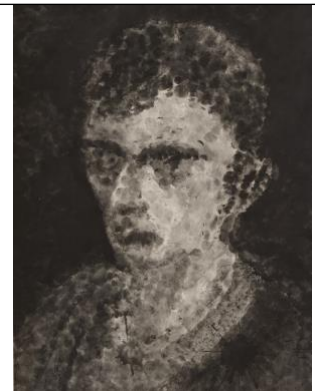
Self Portrait, 2019, India Ink & Alternative Drawing tools