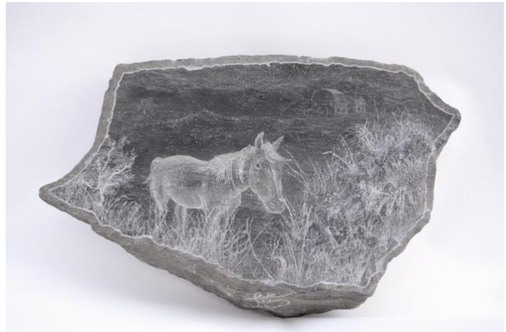
Horse, 2019, Etched Rock