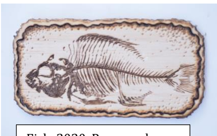
Fish, 2020, Pyrography